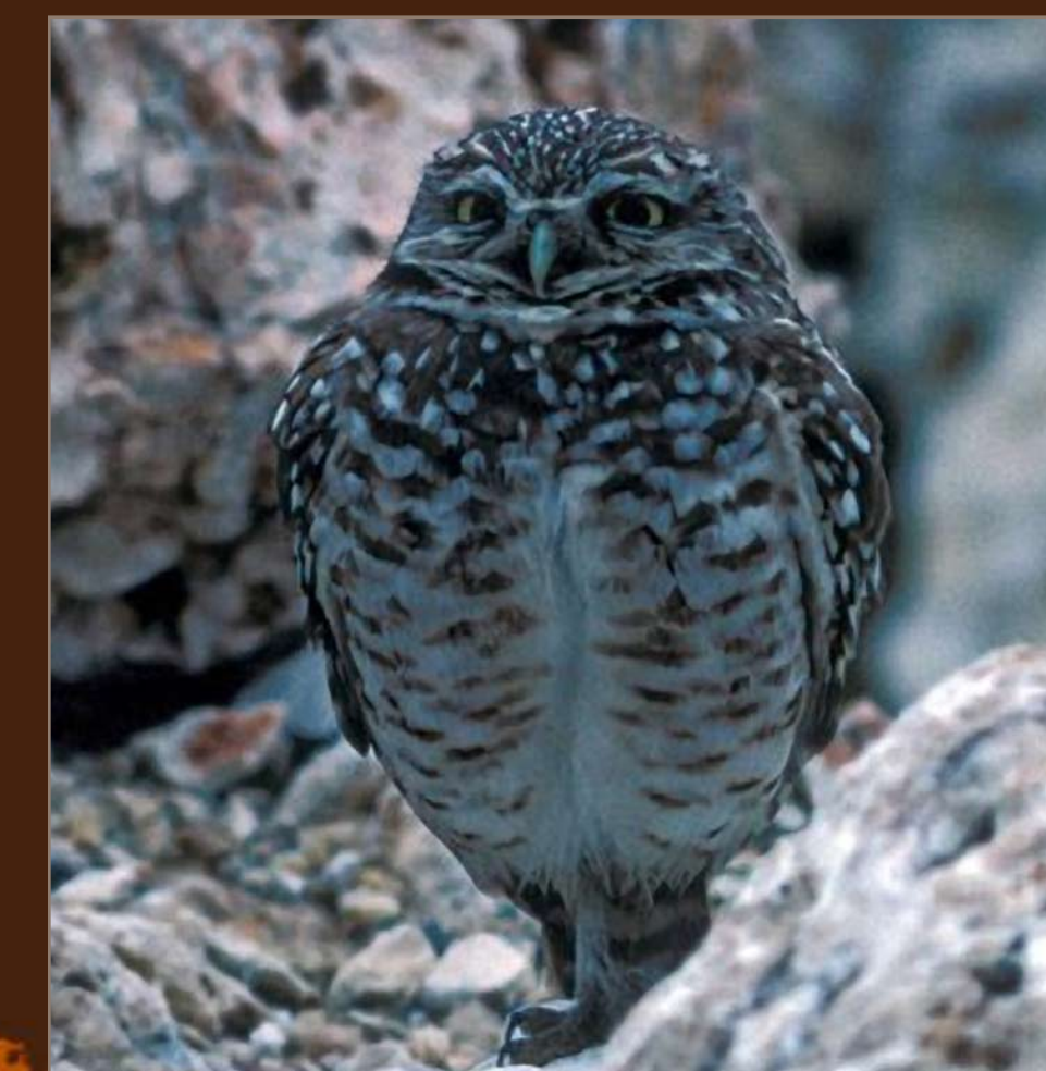
Burrowing Owl/Ted Lee Eubanks

Along the Byway, look for short-cropped grassy fields with scattered dirt mounds. These are signs of black-tailed prairie dog "towns." At The Nature Conservancy's Cheyenne Bottoms Preserve, burrowing owls nest in prairie dog holes, just one of many species to utilize the extensive tunnels.