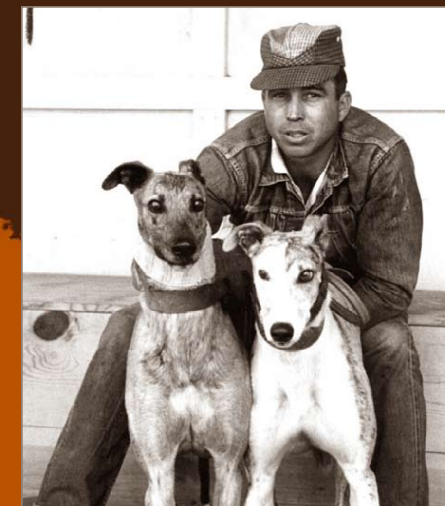
Coursing Greyhounds (Dickinson County)