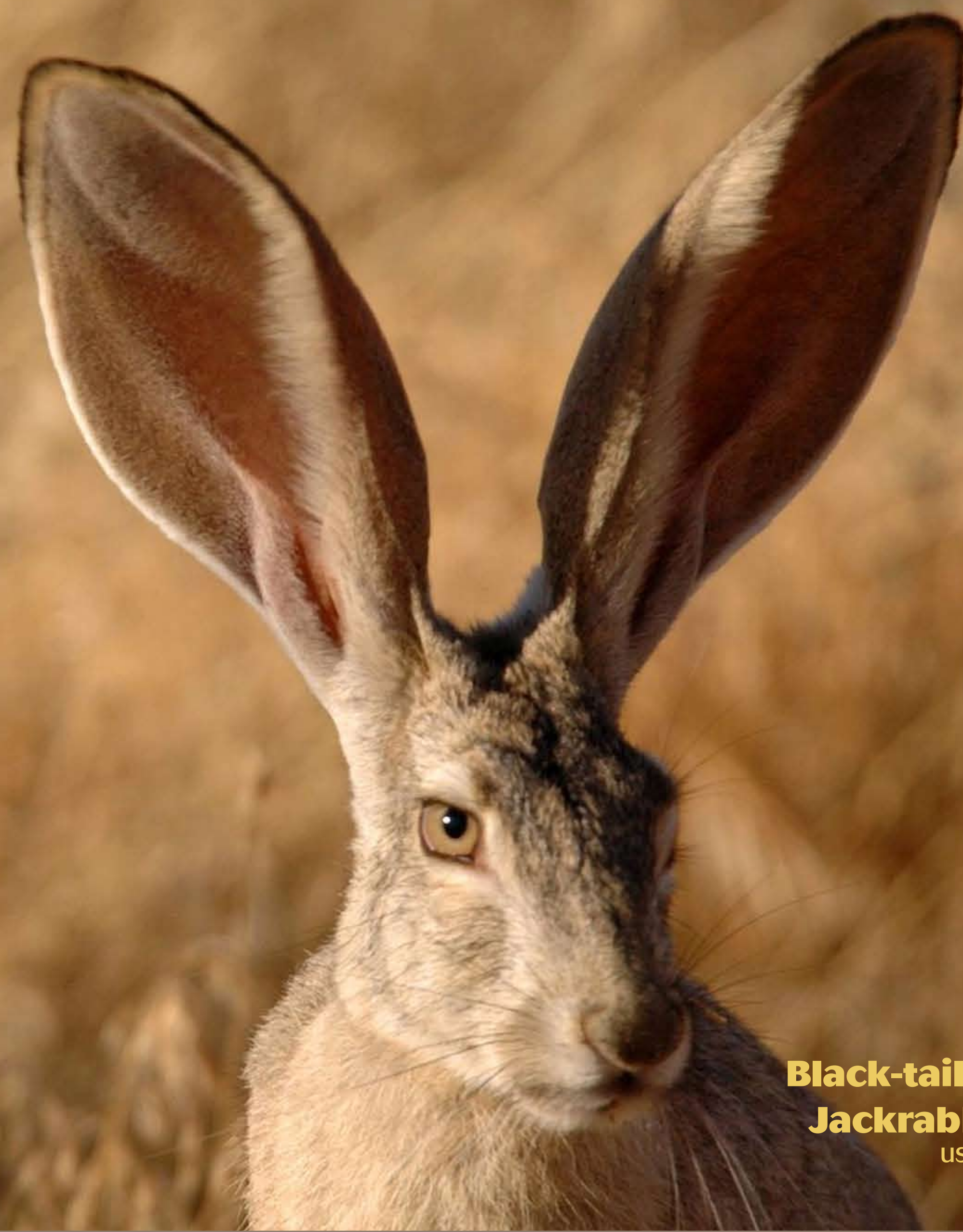
Black-tailed Jackrabbit USFWS