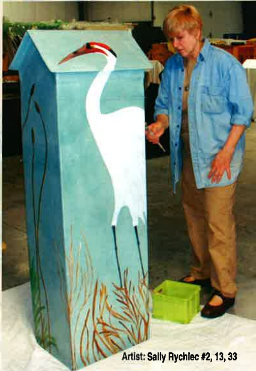
Artist: Sally Rychlec #2, 13, 33

1. Location: 3007 10th St. Name: Elements of Nature Business Sponsor: Great Bend Convention & Visitors Bureau Artist: Whitney Collier