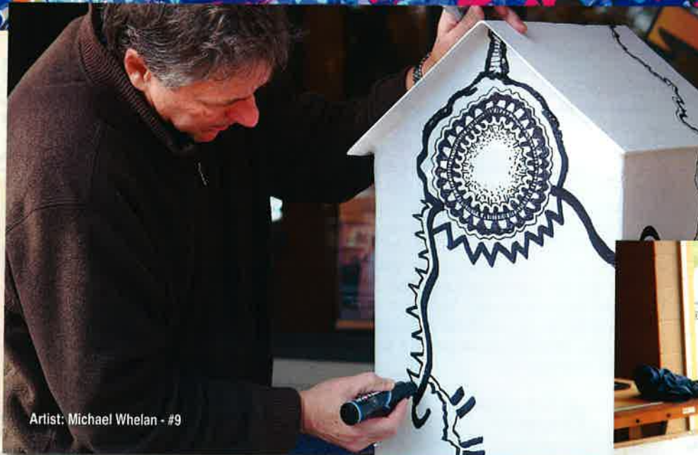
Artist: Michael Whelan - #9